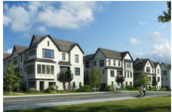
C/O DEWITT CAROLINAS

Situated on Carson Street, the new high end community will feature 32 luxury condos across seven buildings, with unit prices starting in the mid $500,000s.